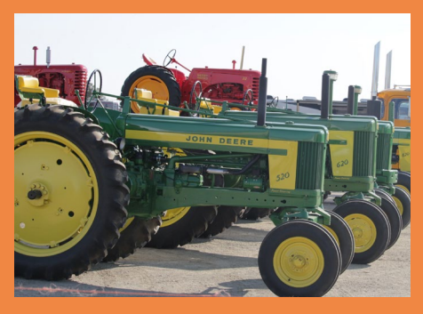
John Deere was the featured Tractor of the 2019 California Antique Farm Equipment Show®

Mark your calendars for the 2020 show! April 17 - 19, 2020