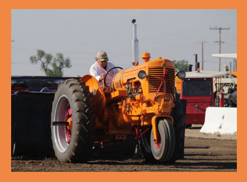
The Friday Night Antique Tractor Pull was moved to it's historical location on the East Side of the grounds, which allowed for more attendees and pullers.