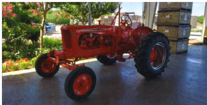
1953 Allis Chalmers WD45 Row-Crop Tractor