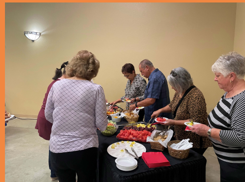
Volunteers enjoying some refreshments during social hour.