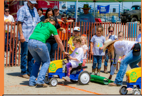
Children having some fun pedal pulling.

The volunteer thank you party was on Friday, May 20 in the Social Hall. The mixer began at 5:00 p.m. and dinner at 6:00 p.m. Volunteers who worked at the California Antique Equipment Show™ enjoyed a night full of fun! Volunteers mingled, swapped stories, and ate some delicious food. Thank you all for volunteering at the 2022 "Antique Show"™.